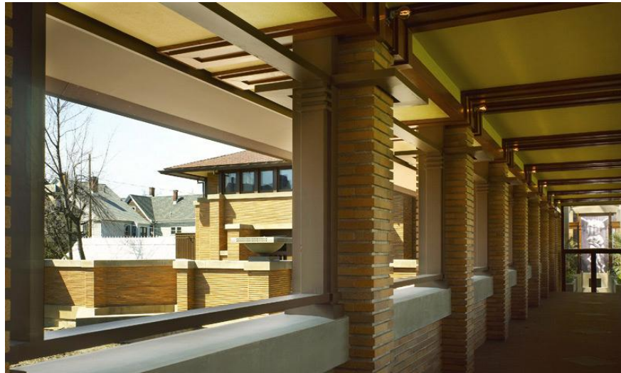
Reconstructed Pergola- Frank Lloyd Wright's Martin House- http://www.darwinmartinhouse.org/tour.cfm# .