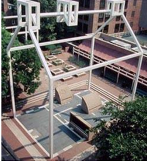
Franklin House steel “Ghost Structure” in Philadelphia, PA