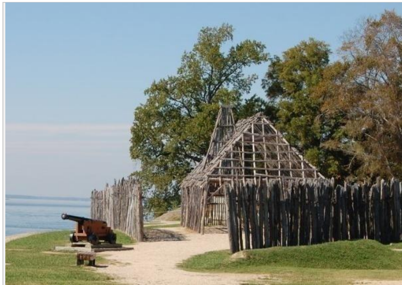
Parts of the original Jamestown Fort being reconstructed-Colonial National Historical Park