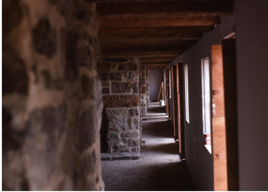
Fort Frederick State Park, Big Pool, MD. September 11, 1975, east barracks interior under reconstruction; note stone facings on fireplaces, covering modern cinderblock to simulate a solid stone masonry.