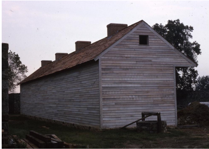
Fort Frederick State Park, Big Pool, MD. August 11, 1975, east barracks under reconstruction, showing modern construction methods that would not show in the final product.