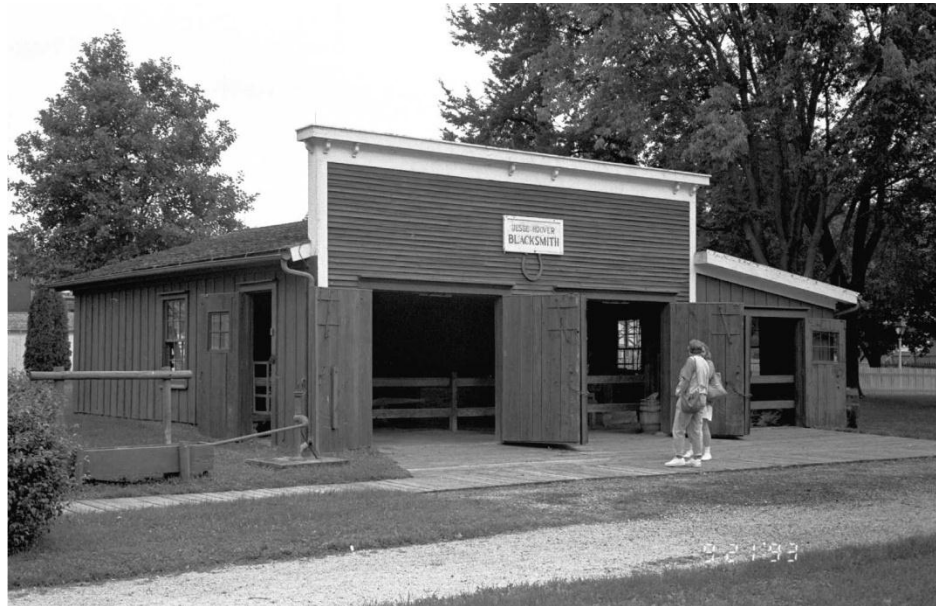
Reconstructed Blacksmith Shop-Herbert Hoover NHS