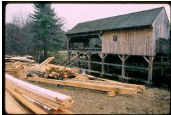
Reconstructed Sawmill- Old Sturbridge Village