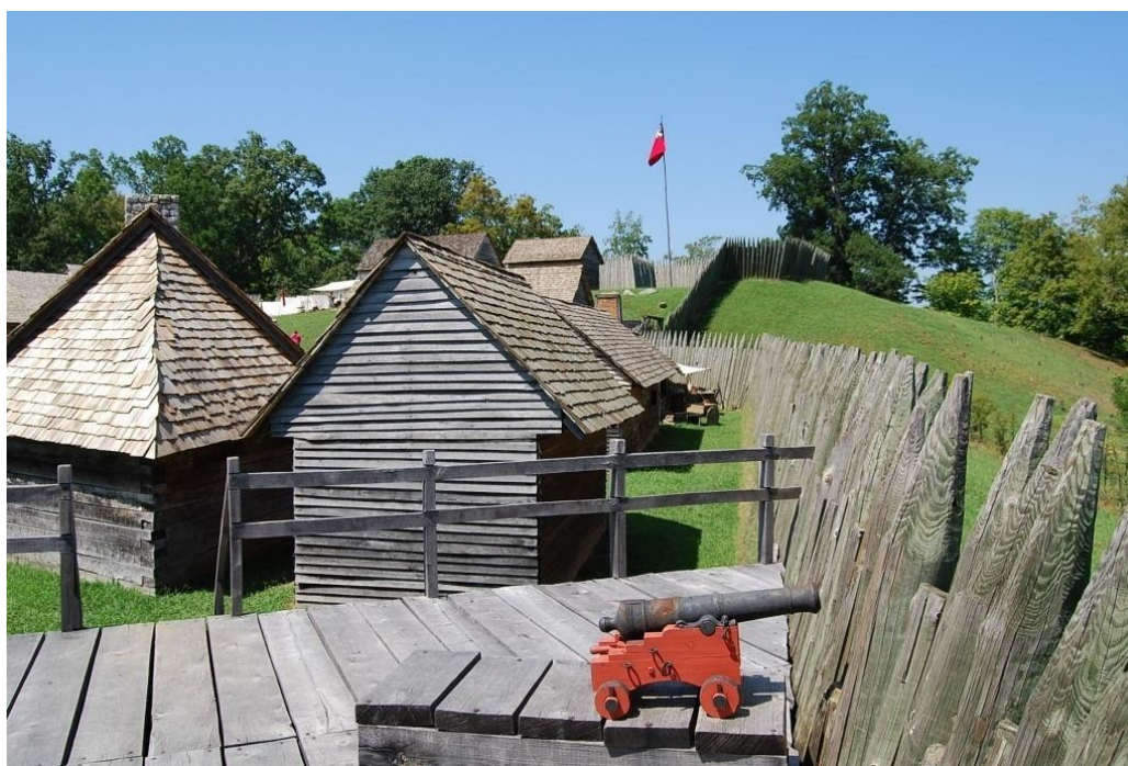
Fort Loudoun View- Photo provided by Fort Loudoun State Park.