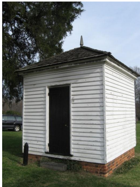
Reconstructed Smokehouse at Red Hill