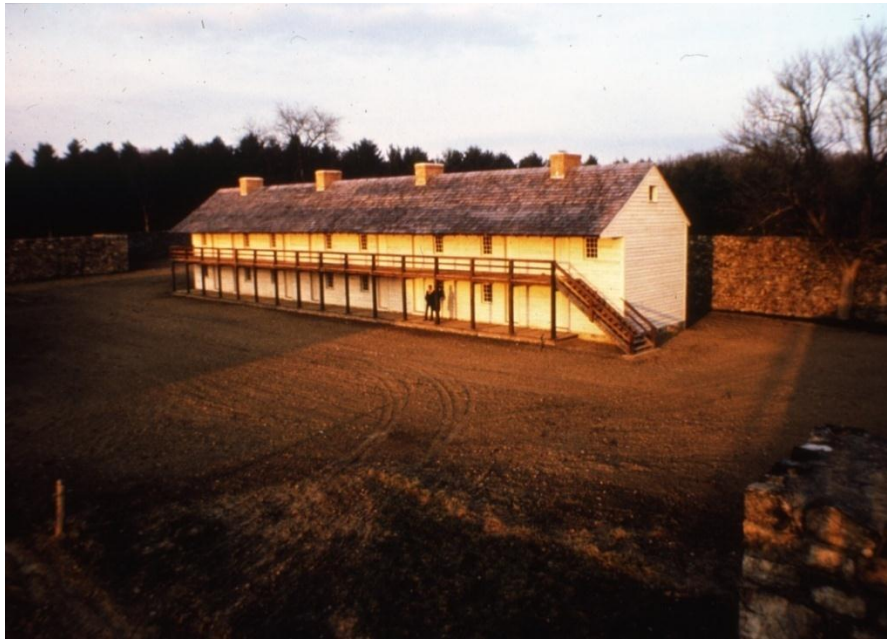
Fort Frederick State Park, Big Pool, MD. November 1975, east barracks upon completion of reconstruction.