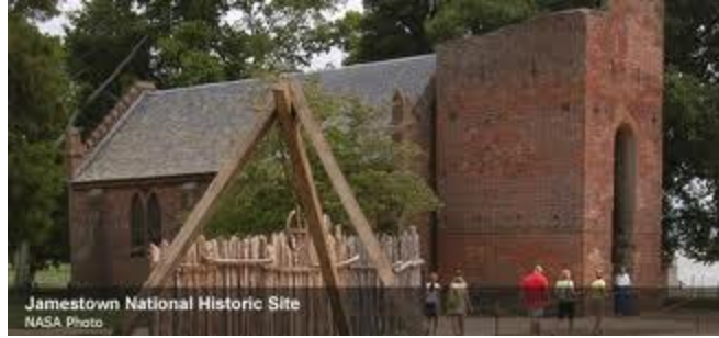
Reconstructed Jamestown Church