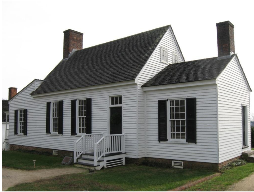
Front of main house at Red Hill National Memorial