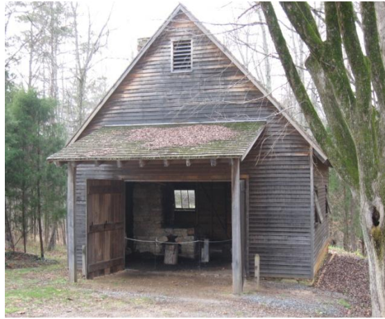
Reconstructed Blacksmith Shop