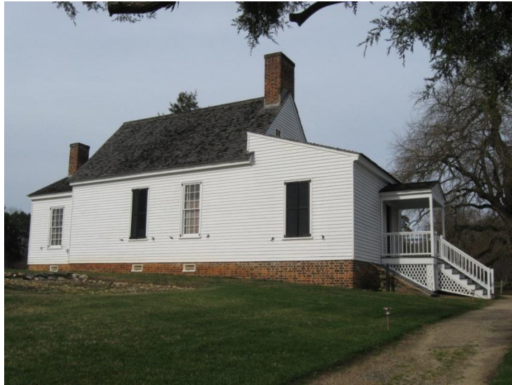
Back of Main House at Red Hill National Memorial