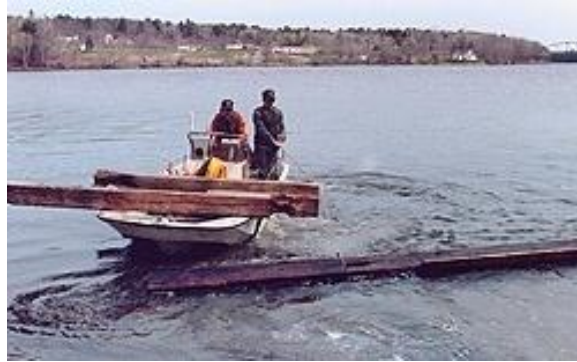
Workers from Maine's Department of Conservation go after logs from the blockhouse that was destroyed by a flood in 1987.