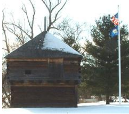
Fort Halifax's Reconstructed Blockhouse.