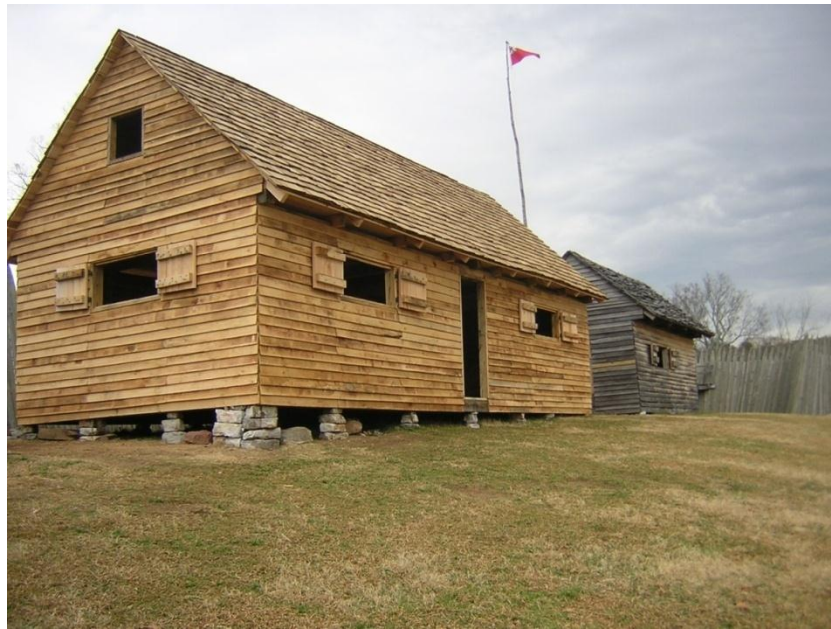
Fort Loudoun-Commandant's Quarters.