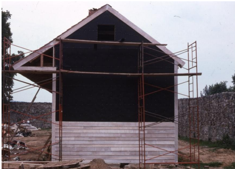
Fort Frederick State Park, Big Pool, MD. July 25, 1975, west barracks under reconstruction, showing modern construction methods used in places that would not show in the final product.