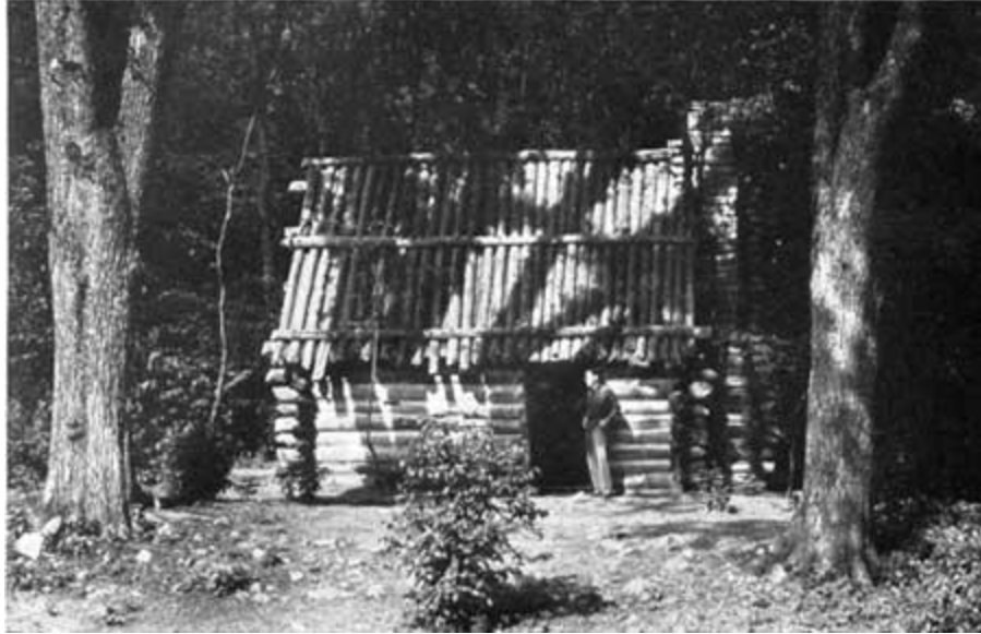
Reconstructed soldier hut at Morristown National Historical Park