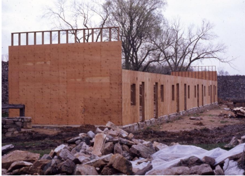
Fort Frederick State Park, Big Pool, MD. May 5, 1975, east barracks under reconstruction, showing modern construction methods used in places that would not show in the final product.