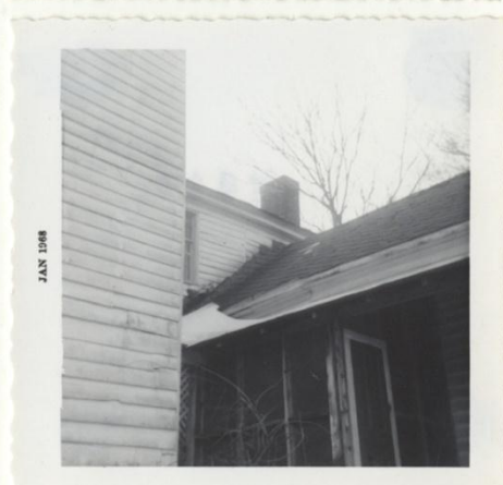
Wright Tavern, Wentworth, NC : Color photos show reconstruction of rear ell. Other miscellaneous photos.