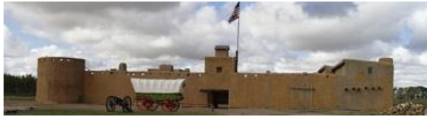
The Reconstructed Bent's Old Fort NHS