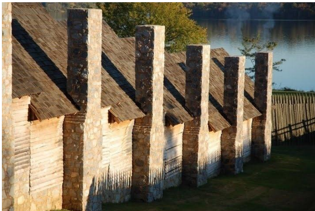
Fort Loudoun, TN.