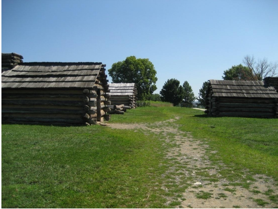
Reconstructed soldier huts-Valley Forge National Historical Park