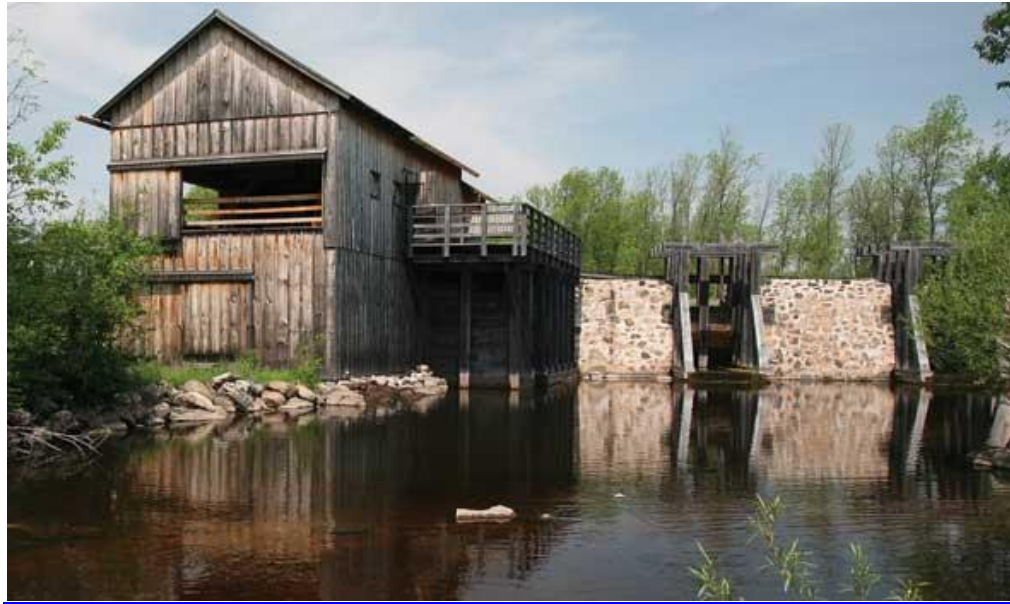
Reconstructed Sawmill at Wade House.