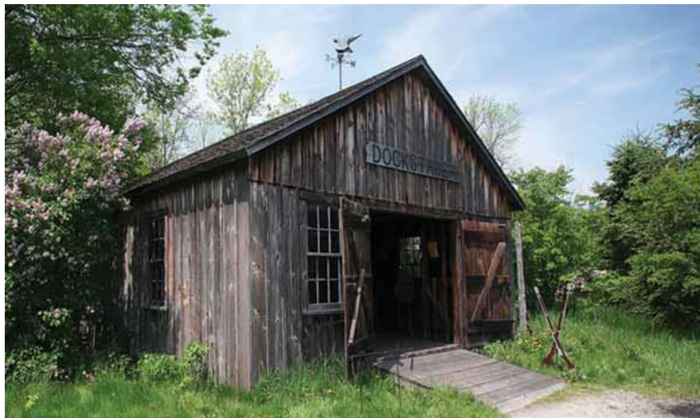
Reconstructed Blacksmith Shop at Wade House.