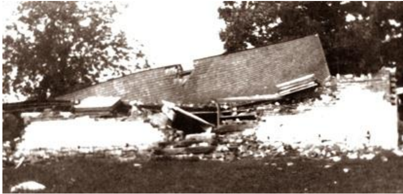
Dunker Church destroyed by windstorm- Antietam National Battlefield.