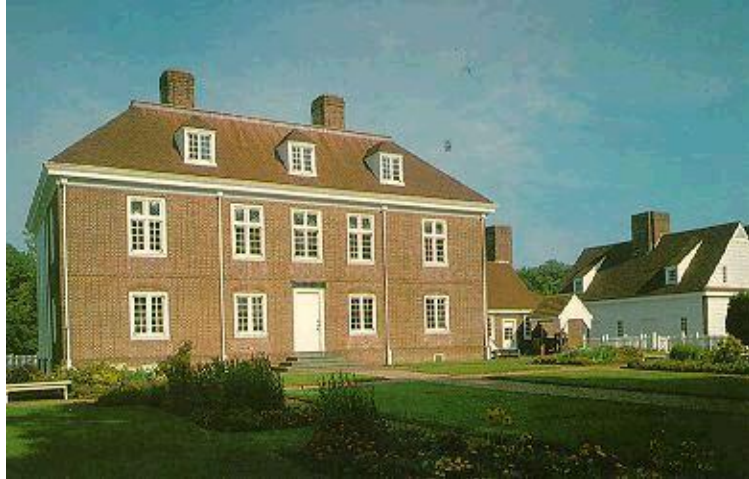
Reconstructed Pennsbury Manor-Photo from the Pennsbury Manor Website. http://www.pennsburymanor.org/Photos.html .