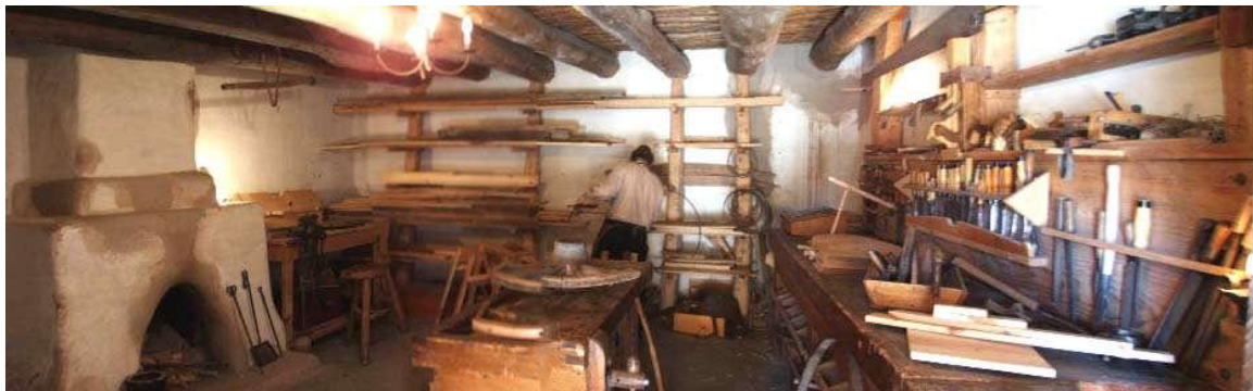
The Reconstructed Bent's Old Fort NHS-Carpenter Shop-Photo taken from website- http://www.nps.gov/beol/photosmultimedia/Virtual-Tour-of-Fort.htm .