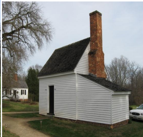
Reconstructed Kitchen at Red Hill