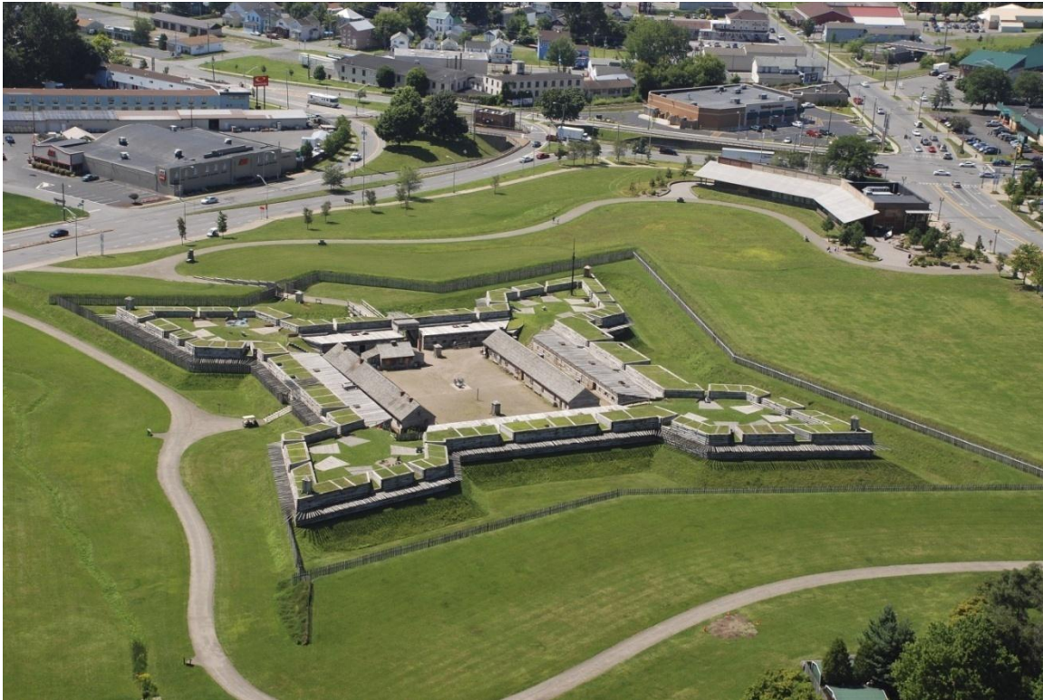
Reconstructed Fort Stanwix