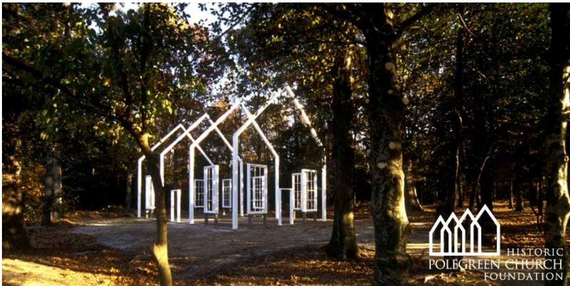
Polegreen Church “Ghost Structure”