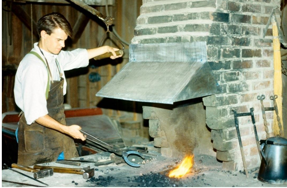
Blacksmith demonstrating in the Reconstructed Blacksmith Shop at Herbert Hoover NHS