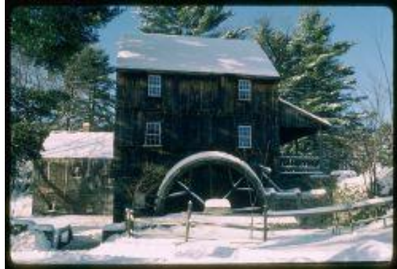
Reconstructed Gristmill-Old Sturbridge Village.