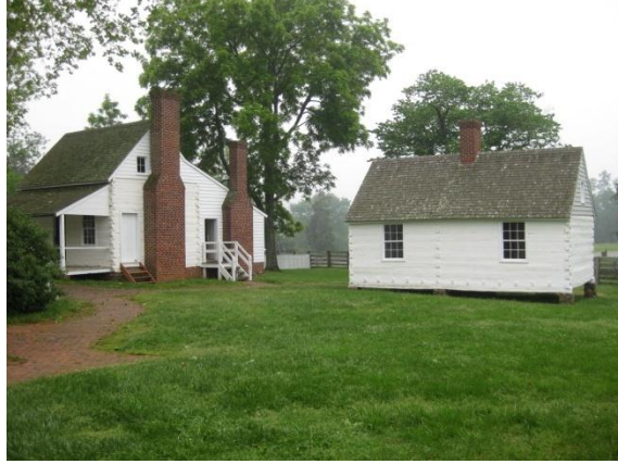
Reconstructed McLean House Slave Quarters and Kitchen