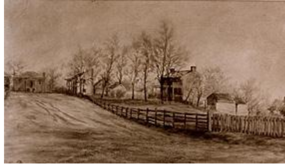
One of George Frankenstein's paintings of the village of Appomattox Court House in 1866. "Main Street" facing east down the Lynchburg-Richmond Stage Road. McLean House and outbuildings on the right and the Courthouse straight down the road.