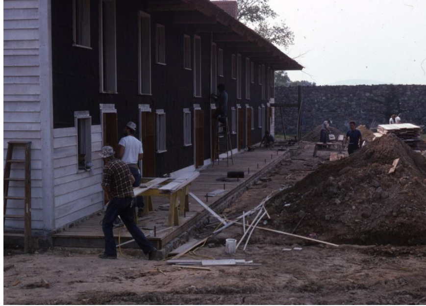
Fort Frederick State Park, Big Pool, MD. September 11, 1975, west barracks under reconstruction.