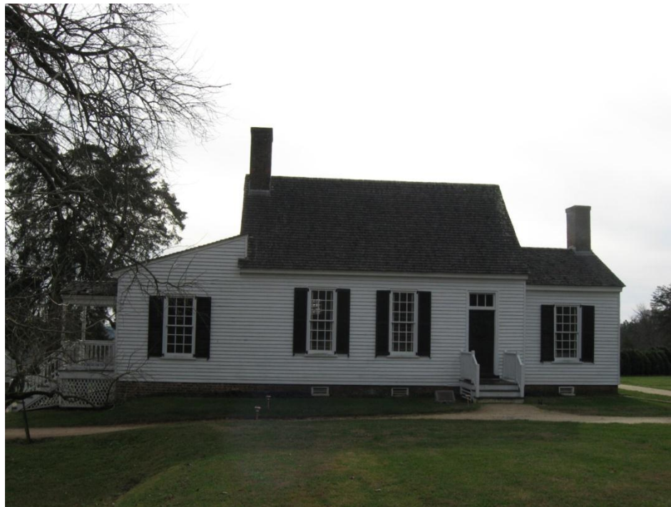
Front of Main House at Red Hill National Memorial