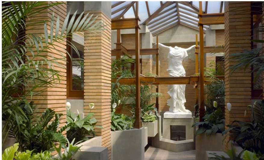
Reconstructed Conservatory- Frank Lloyd Wright's Martin House- http://www.darwinmartinhouse.org/tour.cfm# .