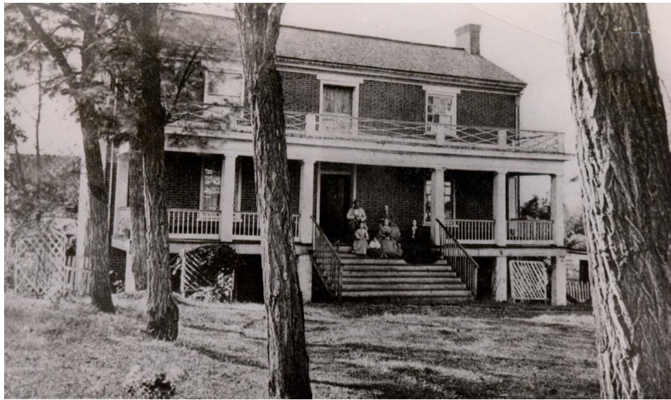
1865 McLean House