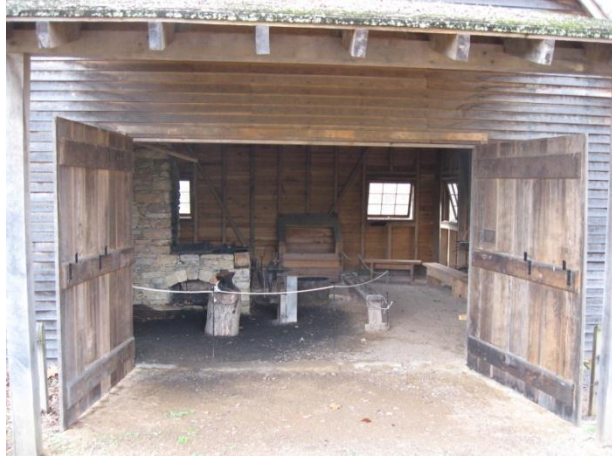
Reconstructed Blacksmith Shop