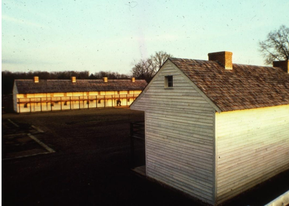
Fort Frederick State Park, Big Pool, MD. November 1875, west barracks (foreground) and east barracks upon completion of reconstruction.