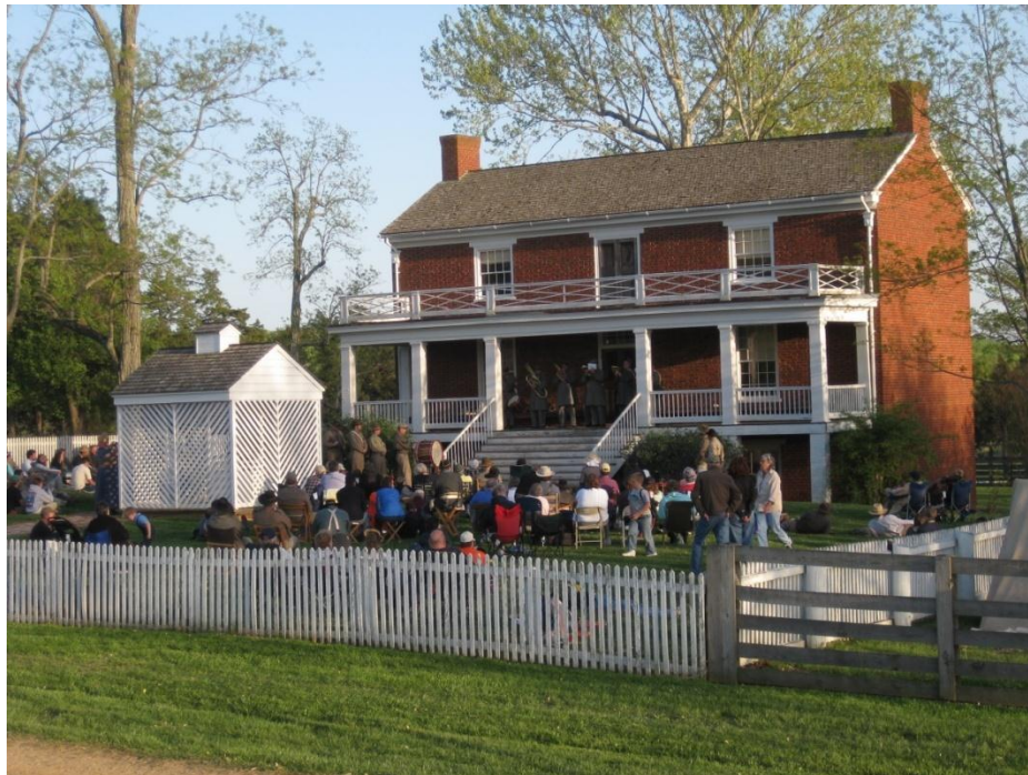
Reconstructed McLean House