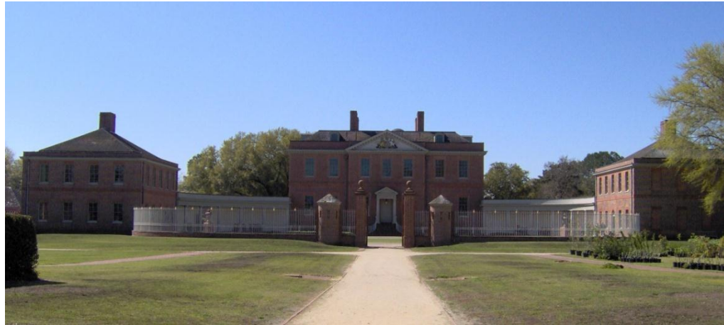
Reconstructed Tryon Palace. New Burn, NC.